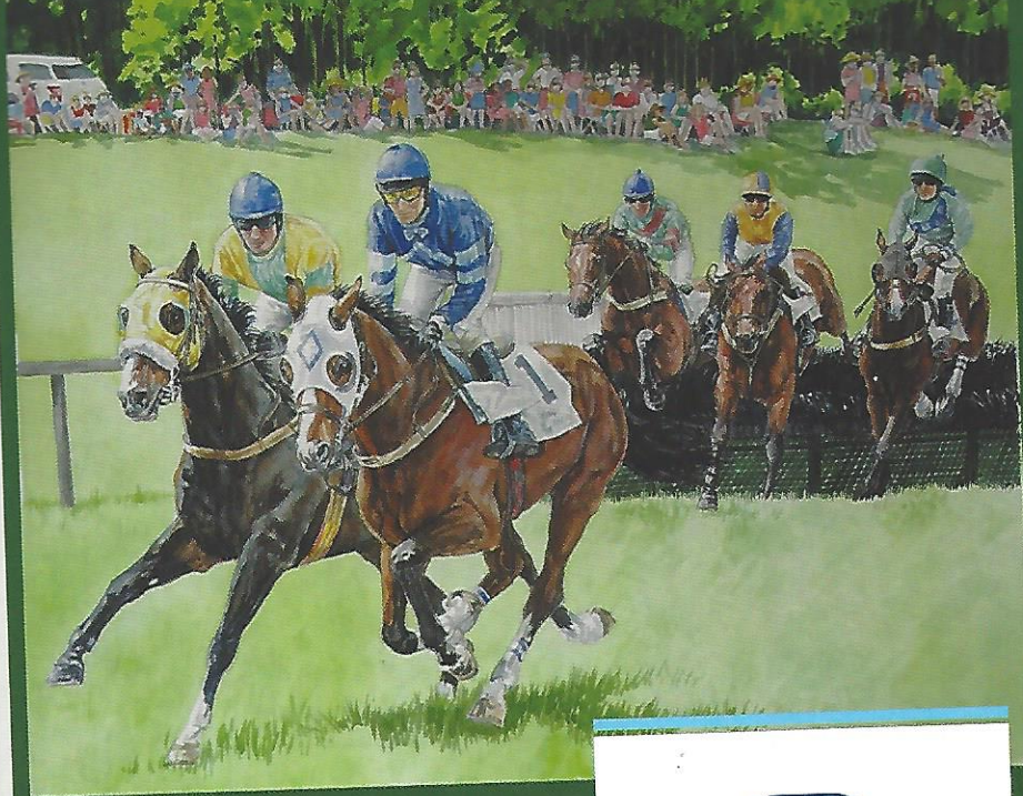
2016 Block House Painting by Laurie Sullivan.